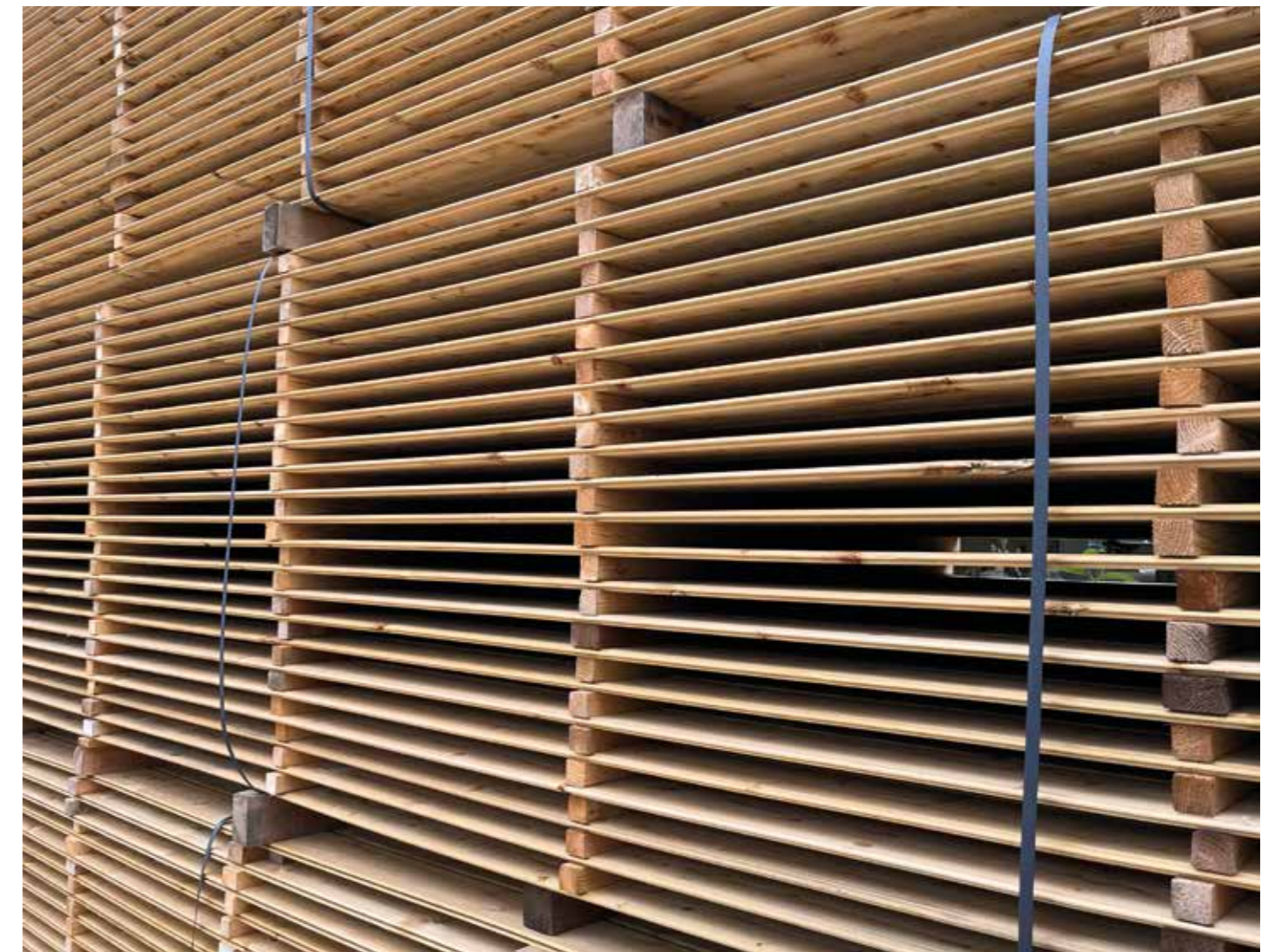
Latted timber drying process