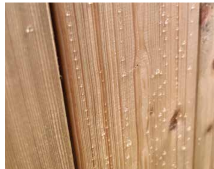
Water beading and run off after oil treatment

You have three basic options for care and maintenance of pressure treated wood: stains, sealants, and paints. You may also choose to oil the wood, which is fine and will give wood a glossy glow, but that doesn't mean you can skip the preservative stage. Any preservative, whether that's stain, sealant, or paint, will slow down the drying process and help keep your wood supple and straight.