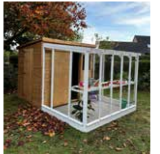
Gisburn Combi Greenhouse